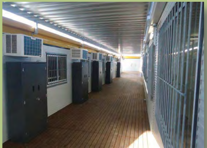
Commercial Construction Western Qld

Eco 5000 performs in every single environment – cold, hot, wet, dry or snow and the 25 year warranty gives you additional peace of mind.