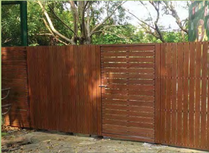
Fencing & Screening